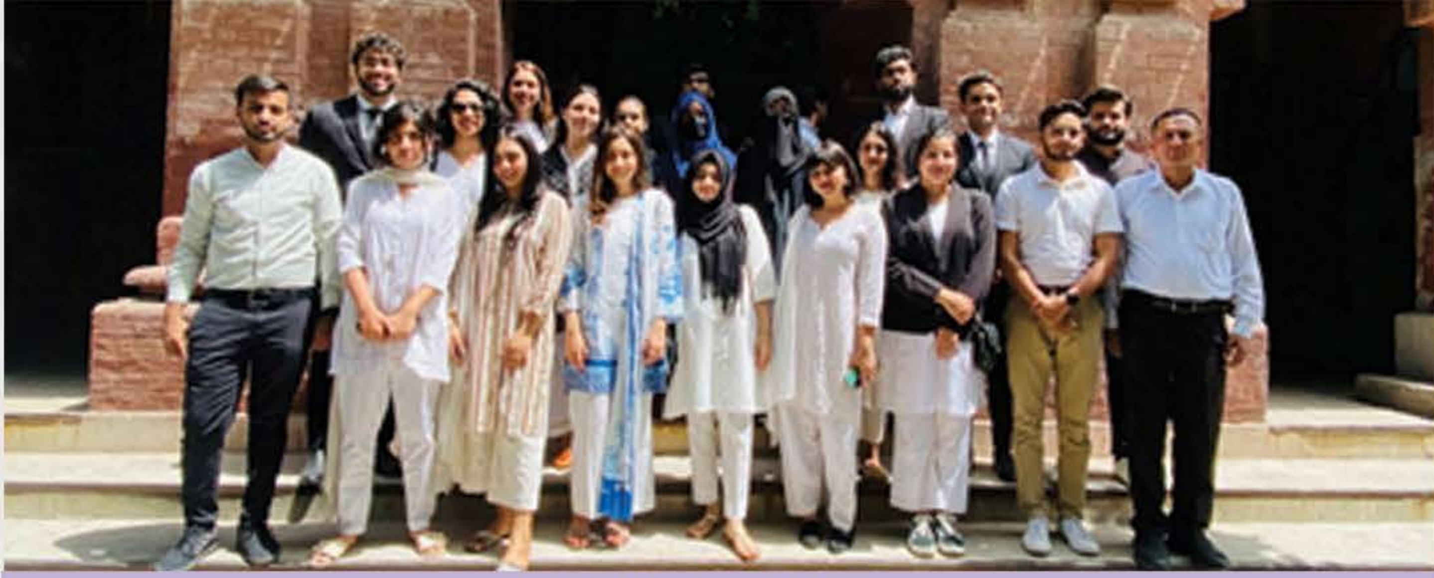
CLASS OF 2023