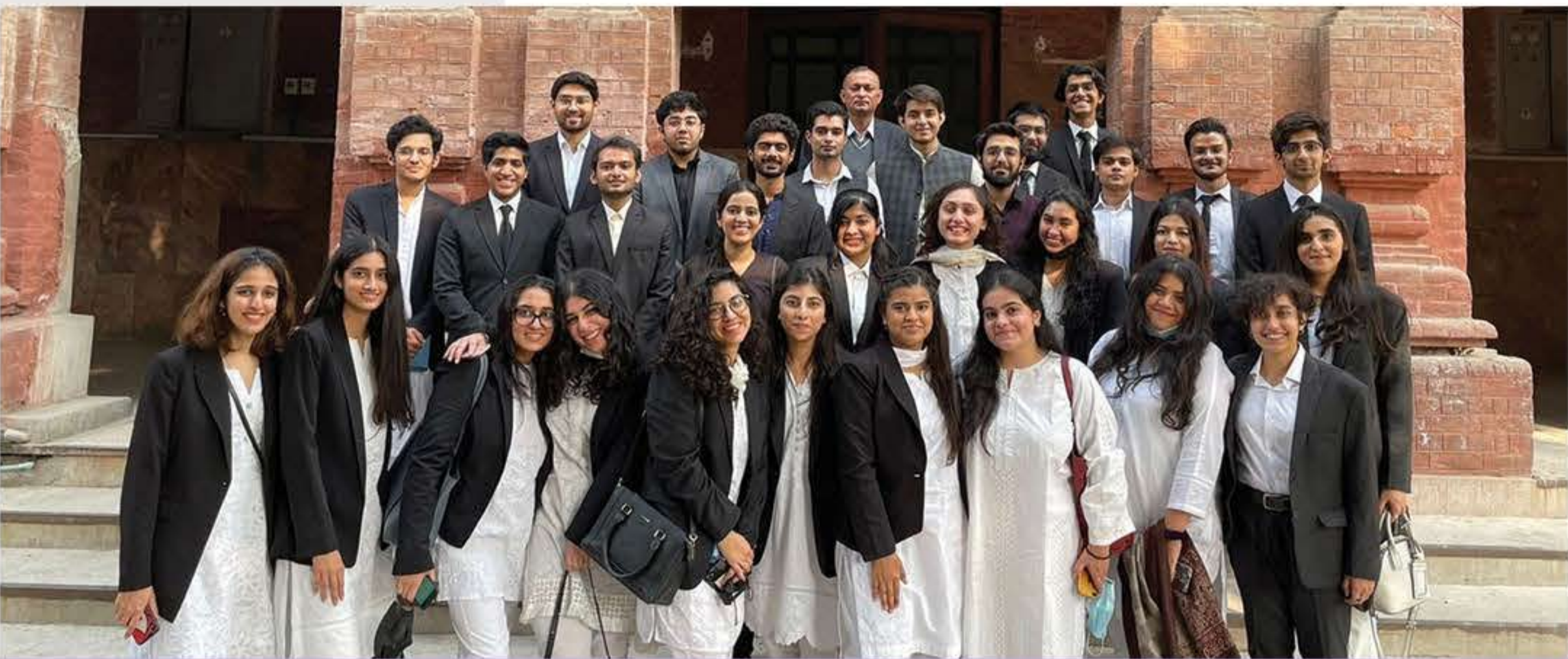
CLASS OF 2024